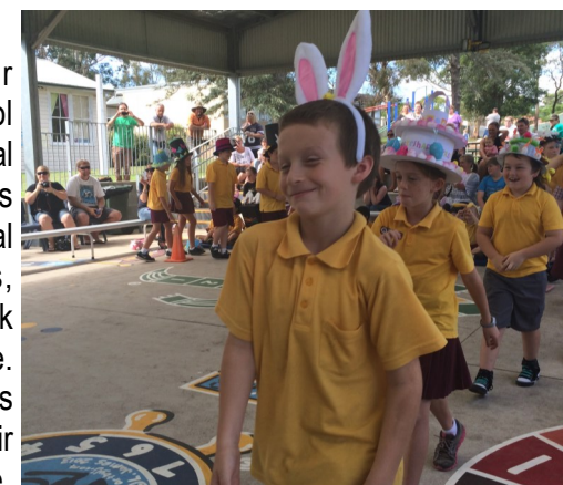
Easter Hat Parade

We are always looking for opportunities to get our school community into our school for special events such as father's/mother's day breakfast and lunch, special assemblies, sports fun days, grandparent days, education/book week activities and many more. These are always fabulous events and the students love seeing their parents having a great time.